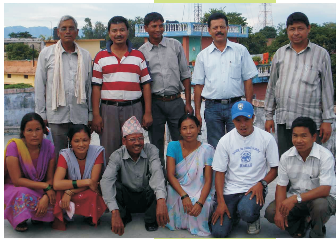
BASE central committee members

BASE has focused on expanding it's network from grass-root to national and international level that result in strongly reaching the voice of oppressed people of grass-root level and support to work on human rights.