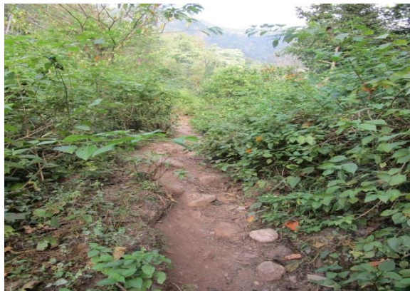
After the completing of construction work

beneficiaries had dropped out their work and again BASE selected other new beneficiaries consulting ward representatives. And finally the extension of work was launched which was regularly followed up and monitored by ward representatives, BASE staffs, and sometimes by personnel of Tayar Nepal project. Now, 1629 meter long, 1.25 meter width and