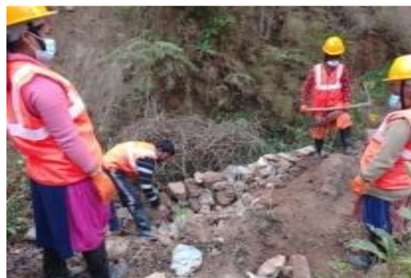
During construction work of the track road

BASE has extended 1629 meter long foot tract at Ghorahi Sub-Metropolitan City Ward no. 1 that joins Atthaise village to Chamero Cave. The work of scheme started on 28th