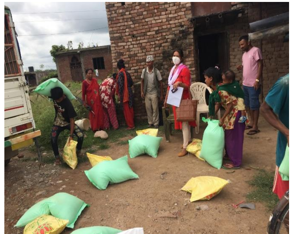
EMERGENCY RELIEF MATERIALS DISTRIBUTION TO CHILD LABOR FAMILIES DURING THE LOCKDOWN CAUSED BY THE COVID 19 PANDEMIC

during 5 days capacity assessment and M&E workshop at Kathmandu. Likewise, these findings have been shared with the Tulsipur sub-metropolitan city and Lamahi municipality for policy advocacy.