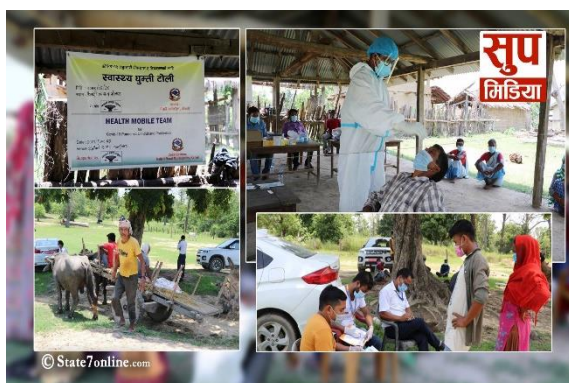
MEDIA COVERAGE OF THE MEDICAL CAMP

BASE Organization operated COVID-19 response activities to support one of the most affected and remote Kailari Municipality of Kailali district during the second wave of COVID. The support activities were carried out through the grant fund received from Kailash Satyarthi Children Foundation, US. During the havoc of the second wave Kailari RM was very affected with the spread of COVID-19 at the community level. The RM is populated with marginalized communities those were lacking their access to the health treatment during COVID infection. Based on the recommendation from the civil societies and request from the local government BASE