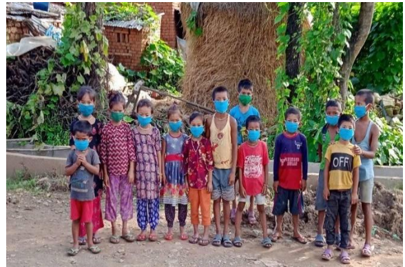
HANDMADE MASKS DISTRIBUTED TO THE CHILDREN FOR THEIR SAFETY

15 sets of PPE were purchased and distributed in three Health Centre Facilities i.e. Panchakule HCF, Shantinagar HCF and