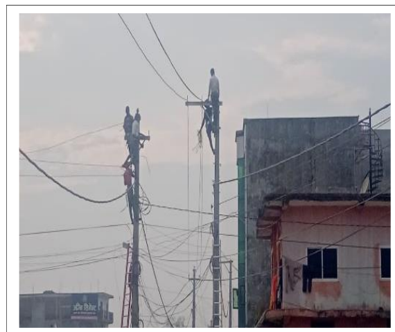
ELECTRICITY POLES BEING TRANSFERRED FROM THE HULAKI ROAD

15 houses were demolished in Taulihawa bazar area. That houses were lied in the road area. 10 houses have received compensation. 5 houses are not received any compensation. During the road construction, there were mud and dust in the roadside. People have been suffering the mud and dust. The market is also affected by the dust and road damages. There are only fewer customers for the traders and shopkeeper.