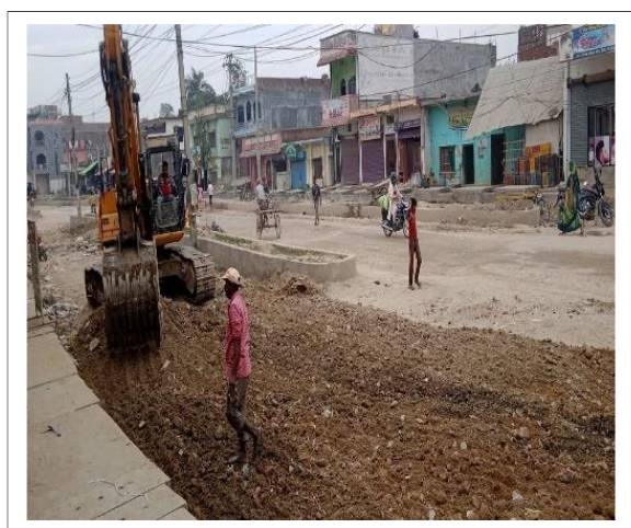
Hulai Road Construction of Kapilvastu after dialogue

In this very meeting Electricity Office, drinking water association ensured to manage the electricity extension pole and underground pipe of drinking water. During the mini- joint interaction, the following consents were agreed-