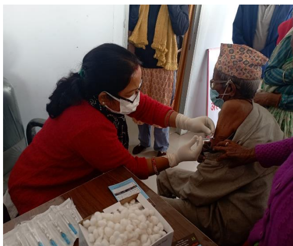
A 92 YEARS OLD MAN GETTING VACCINATED IN GODAWARI MUNICIPALITY

worsening. To address these issues and challenges, the project was designed with the aim to “Improve health resilience among vulnerable communities in 3 districts of Western Nepal” emphasizing two key components, i.e., strengthen resilience of health system to respond to COVID 19 outbreak and future shocks and restore affected livelihood in communities. The project is being implemented in three local governments; Dhangadhi Sub-metropolitan city, Godwari Municipality and Kailari Rural