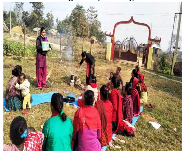
FIELD STAFFS PRESENTING FOOD DEMO AMONG THE MOTHERS

2 days training on nutrition sensitive and nutrition specific agriculture extension has been conducted with the active participant of livestock and agriculture technician. After the training the livestock and agriculture technician of the 10 local level governments has allocated the budgets for nutrition sensitive. During this year Rajpur RM has