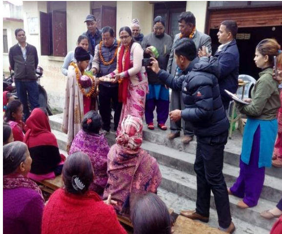
DEPUTY MAYOR OF GHORAHÍ HANDING OVER NUTRITIOUS FOOD TO THE MOTHER

reached 10800 people and they have been received counseling services during COVID-19 pandemic via cell phone about the emergency guideline. 4489 participants (154 m & 4335f) attended and observed food demo session from 238 health mother group (HMG). Among them 2689 were thousand days' mothers, 5 VMFs, 235 FCHVs, 119