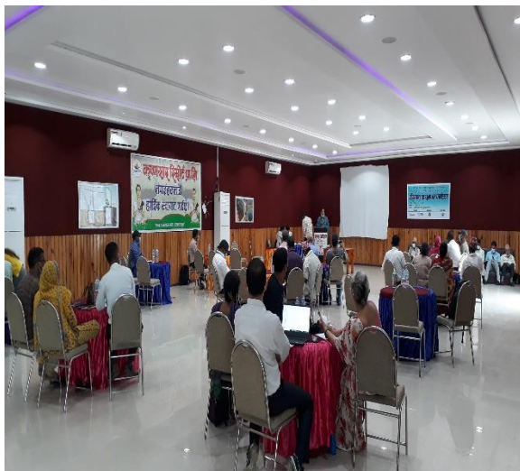
INTRODUCTION AND CONSULTATION MEETING, BANKE

At the request of District Disaster Management Committee (DDMC) BASE organization has implemented Disaster