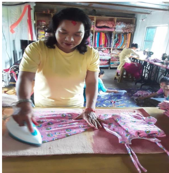
GATMENT WORK BANKE

BASE has implemented Sustainable Economic Development Program of Marginalized Women in Nepal in Dang and