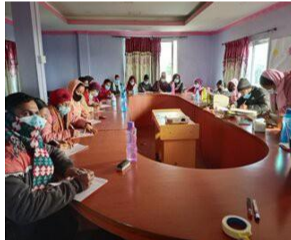
CASE MANAGEMENT TRAINING PARTICIPANTS FROM CBOS

helped palikas to have their own policies to address children issues and Rapti RM which was one of the palikas without any policies and guidelines for children now has received them and are ready to get endorsement. Now the local government and our organization has own the child labor issues.