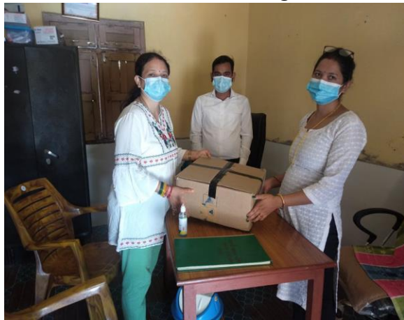
HEALTH EQUIPMENTS SUPPORT TO SHANTINAGAR RM HCF, DANG