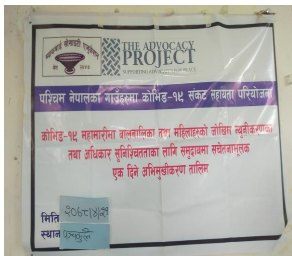
RIGHT BASED ORIENTATION SESSION TO REDUCE RISK AGAINST CHILDREN AND WOMEN DURING COVID-19, DANG

The COVID-19 response program through the financial support of the Advocacy Project, US was implemented in Dang district from June 15 to September 15, 2021. The program activities were carried out in 60 villages with a population of around 10,000 people. The second wave of infections had devastated the Tharu people, who inhabit several districts in the Midwest of Nepal. Infections began to surge in Dang in late May and quickly overwhelmed hospitals in Tulsipur. Two BASE Board members died. The virus also spread quickly in the villages, where villagers were locked down and