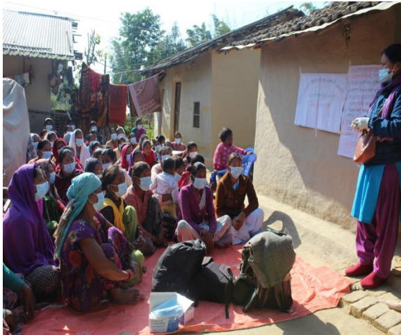
PROJECT KICK OFF MEETING OF KAILARI RM

worsening. To address these issues and challenges, the project was designed with the aim to “Improve health resilience among vulnerable communities in 3 districts of Western Nepal” emphasizing two key components, i.e., strengthen resilience of health system to respond to COVID 19 outbreak and future shocks and restore affected livelihood in communities. The project is being implemented in three local governments; Dhangadhi Sub-metropolitan city, Godwari Municipality and Kailari Rural