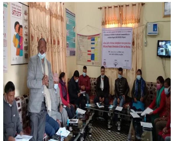
HEALTH STAFF FACILITATING ABOUT THE ADVERTIZED HEALTH FACILITIES, RANA MURA KAILARI

Successfully completed the training to 46 health personnel and local health professionals which enhanced their