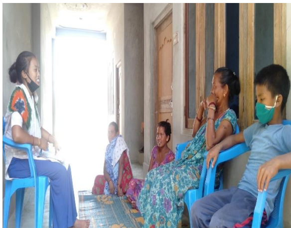
HOME VISIT AND COUNSELING TO THE FAMILIES BY FIELD WORKER

The SAKRIYA project has given opportunity to BASE organization to get recognized in child labor sector. The organization has been able to integrated capacity building in child rights actions such as data collection, campaign activities planning and case management of the children. BASE has been able to accomplish coordination meetings, child protection policy formulation workshops, round table discussions and action planning, situation analysis meetings with the three palikas Tulsipur, Lamahi and Rapti in which total 409 (Male-243 and Female-166) participants participated. Likewise, survey was carried out at the brick kilns of Tulsipur and Lamahi to collect data of child labourers. From this survey total 348 children were found in 15 brick kilns of Tulsipur and total 185 in 12 brick kilns of Lamahi. This findings have been presented to World Education and other partners