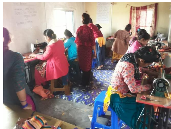
WOMEN GETTING TRAINING OF SEWING AND CUTTING

75 marginalized rural women and youth received advance training packages and running garments factory. They also created market oriented job. Rural women received advance training and enhance their knowledge and skills that have built their confident and run their small business to skip from poverty and slavery. Created common platform and opportunity for the marginalized women and poor families to access into economic activities which is supporting to their livelihood. The women and young girls are started to become good entrepreneurs for their regular income and created job in the community. Every