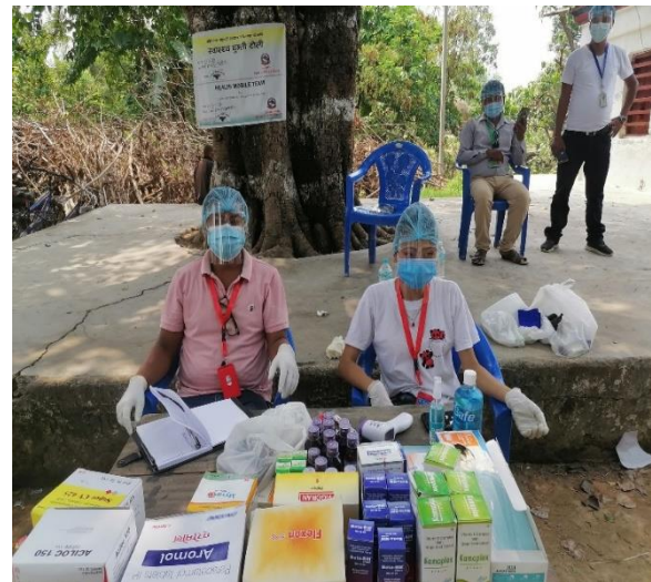
HEALTH PERSONNELS AT THE MEDICAL CAMP

mobilized medical team to carry out rapid COVID response in that RM.