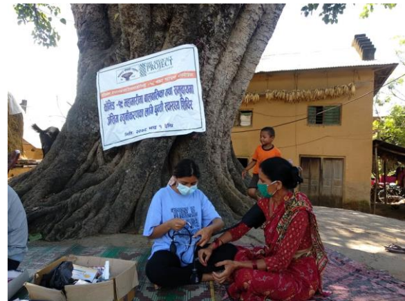
MEDICAL TEAM PROVIDING HEALTH CHECK-UP SERVICES IN THE VILLAGE OF DANG

largely unaware of the threat. The government estimated that over 35,000 were infected by the end of May. As of mid-June, the crisis has eased in the towns but not in the villages. The government was also warning that a third wave of the Delta variant might be imminent and ordered that 20% of all hospital beds be reserved for children. This was causing a great deal of fear. This project has helped BASE and the local authorities in Dang district to deal with this emergency, while also laying a strong foundation to confront future waves of the virus and other pandemics. BASE is well placed to take the lead in such a critical mission. During three decades of advocating for labour rights, the organization has built a network of dedicated community volunteers among the Tharu people and they coordinated BASE's response to the pandemic in the villages. The local government has also entrusted BASE with administering Antigen tests in the villages. Finally, BASE recently established two health teams that have begun to take health care into isolated villages.