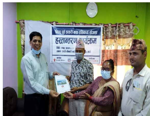
DISASTER PREPAREDNESS PLAN HANDLING OVER TO THE LOCAL GOVERNMENT

We have provided technical assistance for the preparation of Disaster Preparedness Response Plan of Nepalgunj sub-metropolitan city and Rapti Sonari Rural