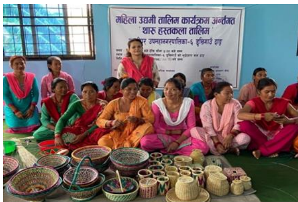
WOMEN LEARNT TO PRODUCE HANDICRAFTS FROM THE TRAINING

government's agricultural unit were distributed to the farmers of the most affected households. The farmers were selected in consultation with the local government and BASE district committee. BASE staffs and Bardiya committee members personally visited the farmers and distributed seeds. BASE has provided an advance level training on stitching indigenous traditional dress and other market demand driven clothes including school uniforms. In total 79 rural women attended in the advance sewing