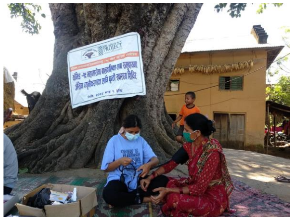
MEDICAL TEAM PROVIDING HEALTH CHECK-UP SERVICES IN THE VILLAGES OF DANG

The COVID-19 response program through the financial support of the Advocacy Project, US was implemented in Dang district from June 15 to September 15, 2021. The program activities were carried out in 60 villages with a population of around 10,000 people. The second wave of infections had devastated the Tharu people, who inhabit several districts in the Midwest of Nepal. Infections began to surge in Dang in late May and quickly overwhelmed hospitals in Tulsipur. Two BASE Board members died. The virus also spread quickly in the villages,