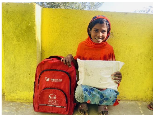
A MUSLIM GIRL OF NARAINAPUR WITH HER OLD AND NEW BAG

good wishes of the Chinese people to the children in beneficiary countries, and expresses the friendship of Chinese people and strengthens people-to-people ties. Therefore, to encourage children to join schools and help them with cost minimize for educational materials purchase BASE has plan to distribute 10000 school bags and 2500