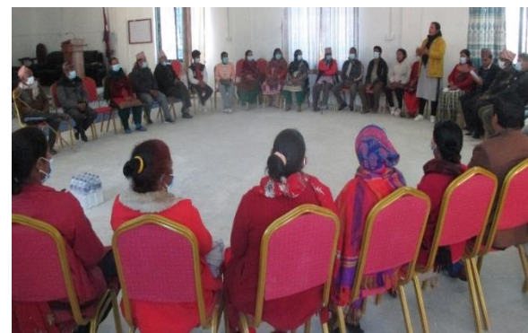
Target group discussing on the GESI policy formation of Rapti RM Dang

The Constitution of Nepal government 2072 has declared the Gender Equality and Social Inclusion as the fundamental Rights and the directed theory of governments. The article 16 of the constitution provided the