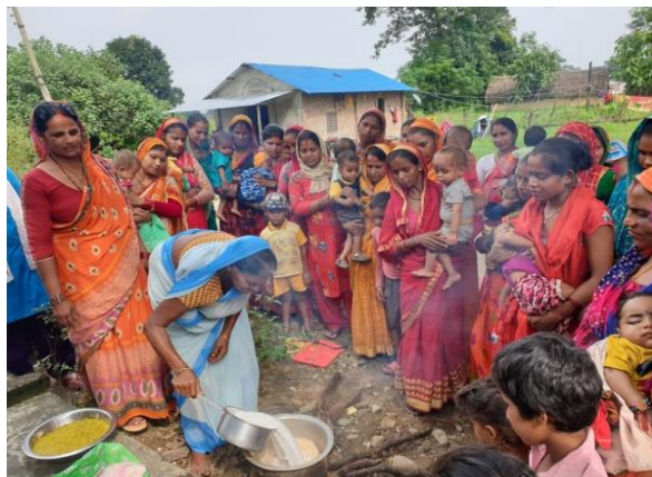
FOOD DEMO TO THE LACTATING MOTHERS

Front line workers reached 3900 households via phone. They have counseled them following the emergency guideline. 458 Schools teachers have received IFA