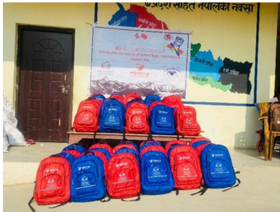
BAGS DISPLAYED FOR THE DISTRIBUTION

Rural Development. The Panda Pack Project aims to improve the basic learning conditions of primary school students in need and help the development of quality education in beneficiary countries. With the theme of “Gifts from Panda Land”, it embodies the