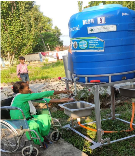
ACCESSIBILITY AUDIT OF HAND WASHING STATIONS

for full functional with technical changes in the tap to make it permanent and semi-permanent. Also new 50 hand washing stations (30 health institutions and 20 schools) instalment and handover has been