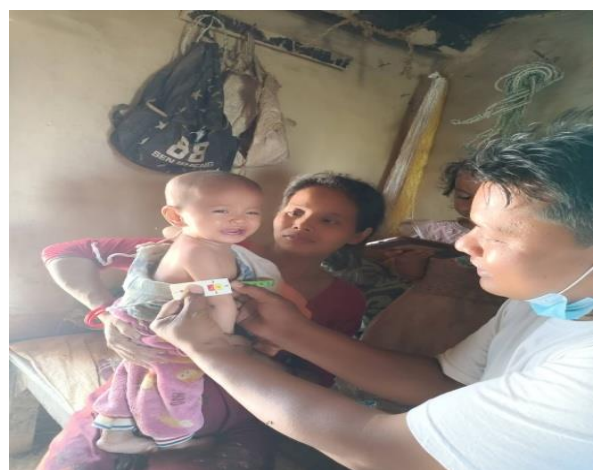
COUNSELING AND HOUSEHOLD VISITS TO MODERATE ACUTE MALNUTRITION BABIES

Vegetable seeds distributed to 1000 days HHs, VMFs and LRPs to minimize potential food insecurity issues due to implications of COVID-19 pandemic crisis on agriculture input supply. One day VMF refresher training for select VMFs in coordination with municipal agri and livestock stakeholders carried out. VMF network meeting has been successfully completed in Rajpur and Banglachuli rural municipalities. We have facilitated on regular functioning of