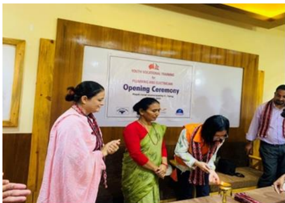
PROGRAM LAUNCH CEREMONY

this regard BASE Organization has been conducting Youth Vocational Training for Plumbing and Electrician with the financial and technical support from China Foundation for Rural Development (CFRD) Nepal office. Total 40 marginalized youth those selected by formal interview are receiving these trainings in Rapti and Gadhwara rural municipality of Dang district. The 3 months training classes have been formally started from September 2022 in coordination with