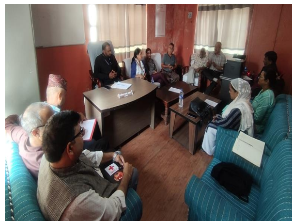
Mini joint dialogue of Banke, Red cross Society Building construction dispute

Sambad Samuha Banke has successfully facilitated and managed the dispute on demolition of Red Cross Society Building and physicians association's building for the improvement of Zonal Hospital Banke. Sambad Samuha Banke has started dialogue in 6 th October 2021 and resolve the issue in