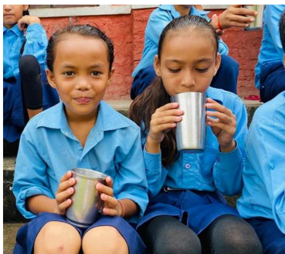
GIRLS HAPPY DRINKING MILK

With total NPR 72.30 children are getting better and healthier meal cooked in the school