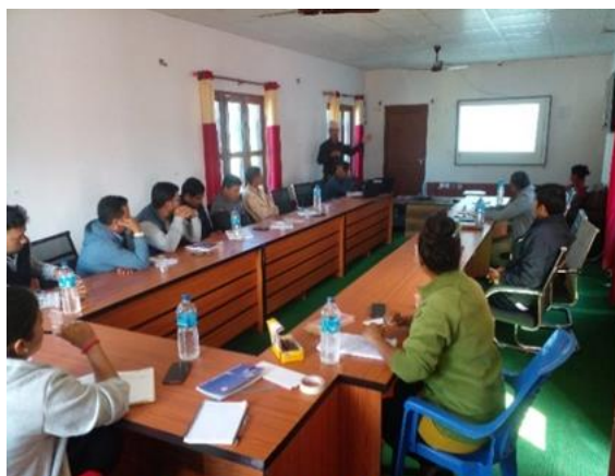
KICK OFF MEETING IN SIMTA RURAL MUNICIPALITY

BASE organization have closely worked with the local government officials from both district, municipal and ward levels as well as non-government organizations. The project has delivered its activities using a consultative approach, working with stakeholders to collectively agree the methodology for this project, review findings and recommendations. 2 Kick-off meeting/Co-creation workshop has been conducted in both Tulsipur and Simta with 48 (37 male and 11 female) participants from the palikas, stakeholders and NGOs. Collation of existing data sources that measure poverty and inequality outcomes have been done