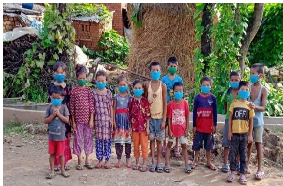
HANDMADE MASKS DISTRIBUTED TO THE CHILDREN FOR THEIR SAFETY

prepared and distributed in the villages to those affected by COVID 19 as well as having similar symptoms. 5 boxes of safety gloves distributed to HCFs along with PPE sets.