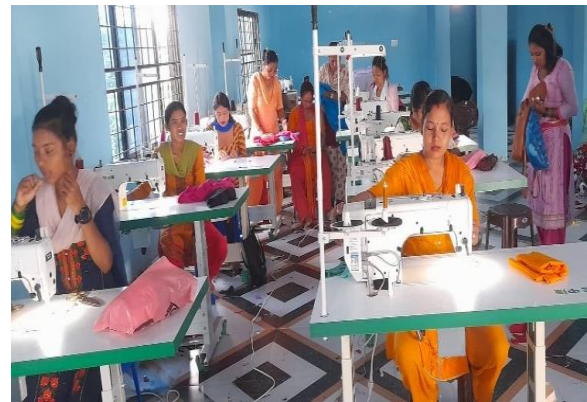
WOMEN IN THE STITCHING TRAINING

excluded farmer's family. The intervention has supported to increase the coping capacity of the disaster affected family members. The 1000 farmers have been targeted to those who have affected by flood,