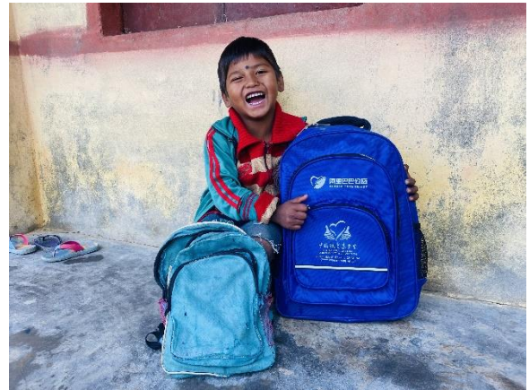
HAPPY BOY WITH HIS NEW BAG

School Bag also known as Panda Pack, gift from panda land which contains School bag, Color box, Stationery box, scale set, pencil, ball pen, English- Nepali copy, painting