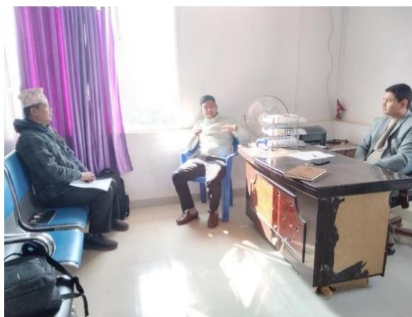
KII WITH EDUCATION DEPARTMENT IN TULSIPUR SUB-METROPOLITAN CITY

Analysis of poverty and inequality data, taking a multidimensional approach to poverty and an intersectional lens to understanding inequalities is ongoing. BASE, has involved in the LNOB-Nepal project in both Phase I (data landscaping) and Phase II (poverty and inequality analysis) activities. BASE has led on: Engagement with stakeholders in the region, with