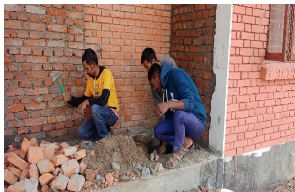
TRAINEES GOT THE EMPLOYMENT AT THE CHIEF MINISTER (LUMBINI PROVINCE) OFFICE QUARTER AT LALMATIYA

In order to conduct the trainings BASE has done a formal agreement with the Alerty Polytechnical College, Butwal. The expert trainers have facilitated the trainings of plumbing and house wiring with 390 hours theoretical and practical classes. 40 youth in Gadhawa rural municipality have received plumbing training whereas 40 youth in Rapti rural municipality have received house wiring (electrician) training.