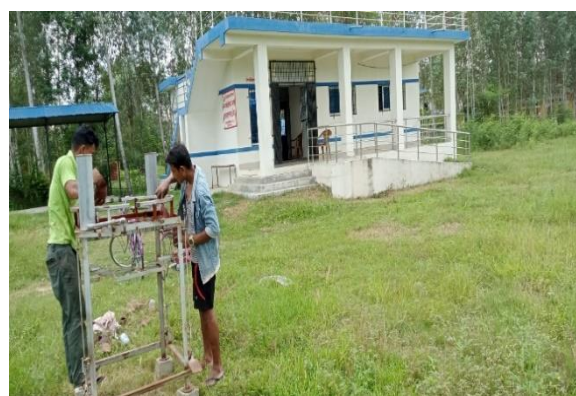
INSTALLING HAND WASHING STATIONS

HBCC-2 project is behaviour centric response to COVID-19 to improve hygiene behaviours and vaccine uptake. The hand washing stations that were provided in different site (105-health institution, EPI clinic, ward office and school) through HBCC-1 were surveyed for functional test and found that more than 95 percent station were not fully functioning. The reason behind its functionality were; the responsible persons were careless about the hand washing station, technical problem- leakage and the thought of general public that the COVID-19 is no more in the community and no need to wash hand with soap like in COVID-19 situation. So, this year HBCC II project has been working to repair and maintain those 105 hands washing stations