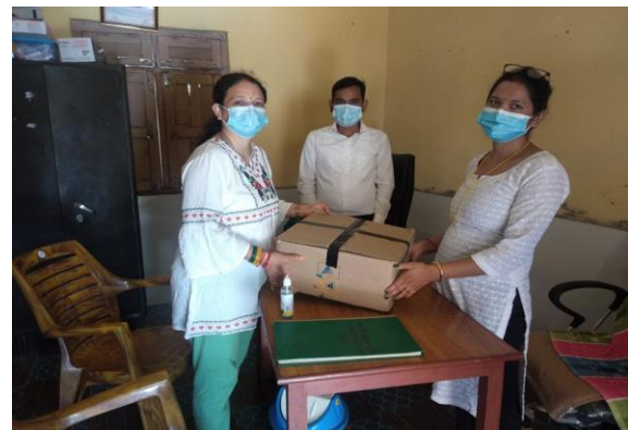
HEALTH EQUIPMENTS SUPPORT TO SHANTINAGAR HCF, DANG

medical camp in the selected villages of three municipalities i.e. Tulsipur sub-metropolitan city, Babai Rural Municipality and