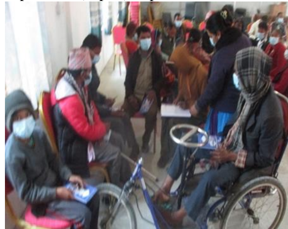
Target group discussing on the GESI policy formation of Rapti RM Dang

They prepared the policy making committee in the local level but due to lacking of the experience (expert) expertise on the area of