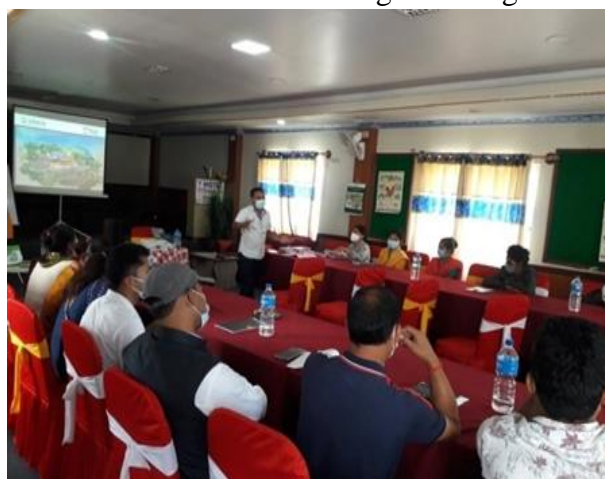
1 DAY VMF REFRESHER TRAINING

FCHVs, 258 adolescent girls, 3769 others. Women of 1000 days have now been practicing to prepare homemade nutritious food for their babies. 2311 targeted mothers' of 1000 days oriented on their key roles and responsibility for 5 different major periods (4 months pregnant, just after giving birth, 6 months babies, first birthday and second birthday) for healthy babies during Key Life Celebration. Onsite coaching on integrated