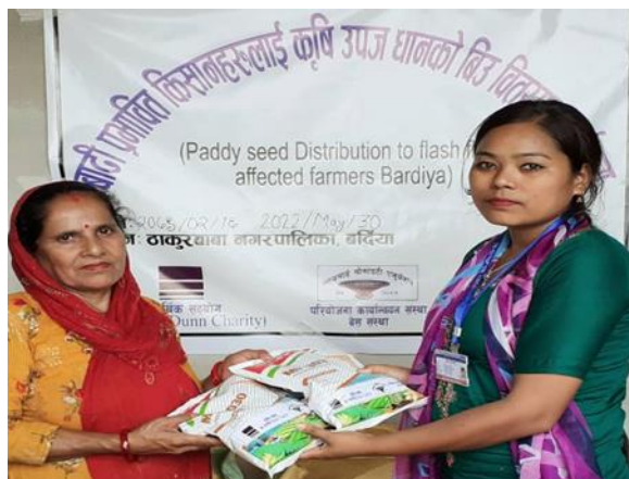
PADDY SEEDS DISTRIBUTION TO FLOOD AFFECTED

BASE has implemented the Increasing Resilience of Disaster and COVID-19 affected Farmers Project in Dang, Bardiya