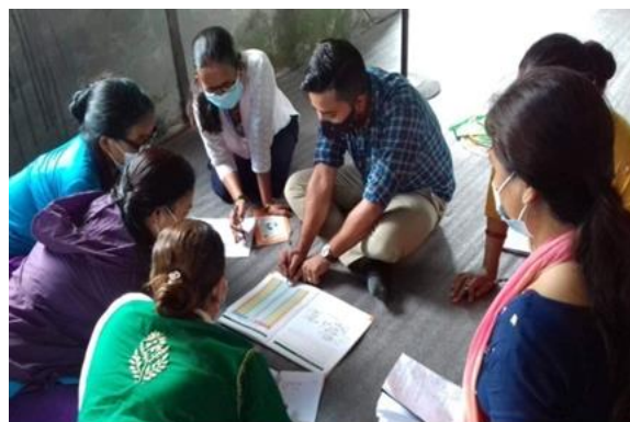
ON SITE COACHING AT OTCS

Approximately more than 10435 people with (M-356 m & Fe-10079) participated in food demo session through 660 health mother group meeting in Dang. Among them 6400 were thousand days' mothers, 10 VMFs, 605